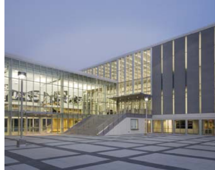
McLeod Center Arena

Our crew won four awards on three continents in 2008. The McLeod Center Arena at the University of Iowa won the Honor Award from the American Institute of Architects in Iowa; Branson Landing won the ICSC's International Design and Development Award; Our master plan of a Sustainable Waterfront Community in Montenegro (part of the former Yugoslavia) took the Silver Medal in an international design competition; And Darwin Waterfront won the 2008 Development Excellence Award given by the Urban Taskforce of Australia. We're honored for the recognition and promise to keep it going in 2009.