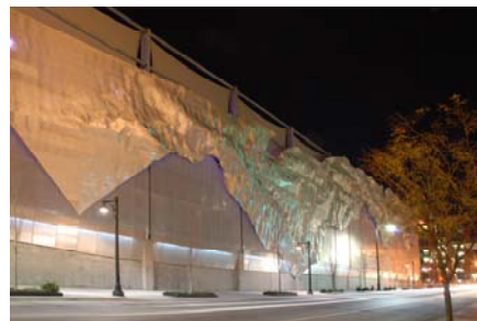
Bartle Hall North Dock