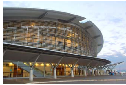
Darwin Convention Center